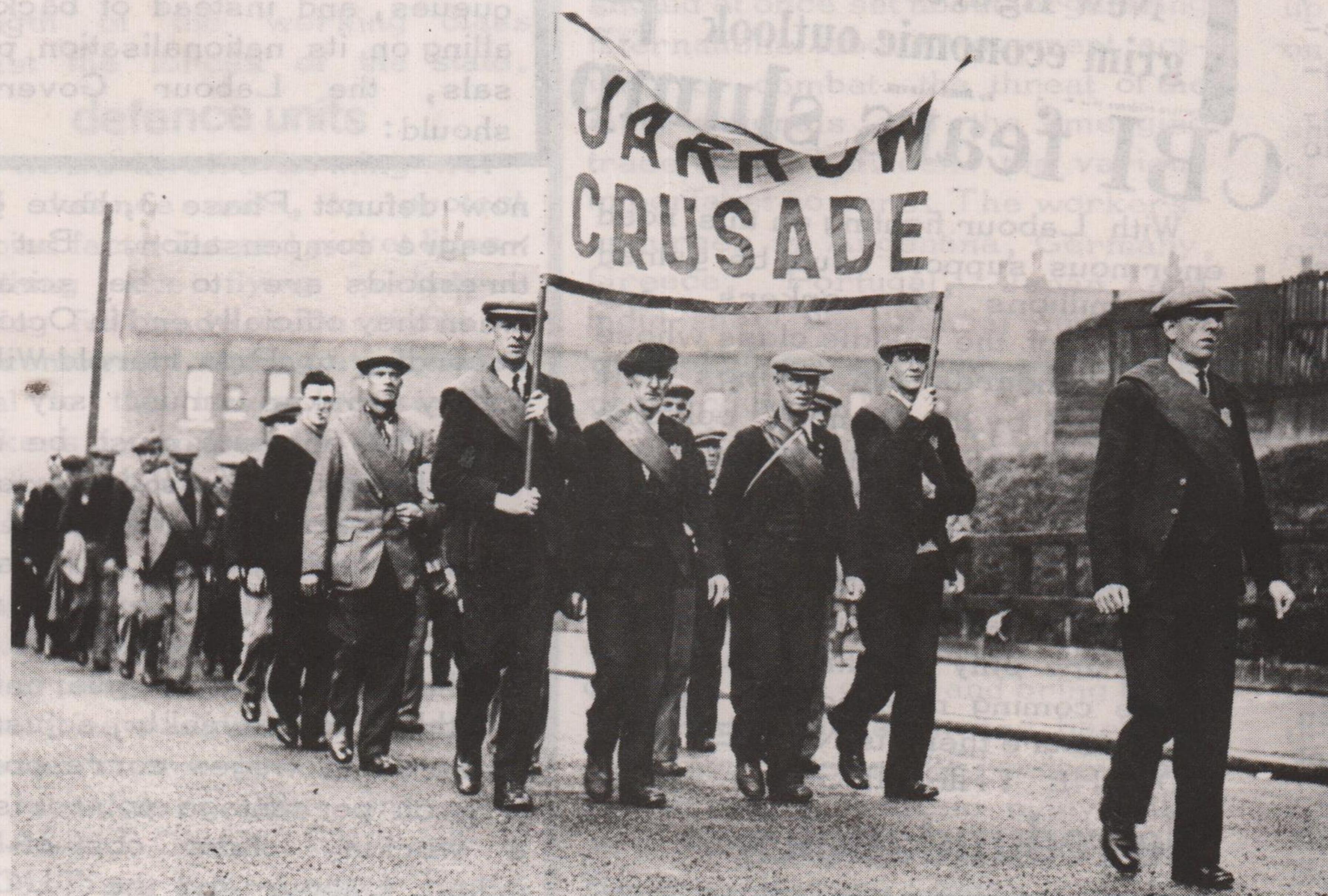
Above: Hunger march in 1930s. This is what the Tories want. Throw them and their system out for good. VOTE LABOUR!

In Parliament, the Tories, and their 'worthy' echoes in the House of Lords wrecked the new Trade Union and Labour Relations Bill by inserting anti-closed shop, anti-strike clauses. In the same way the Tories blocked a move to repay £10million back to the trade unions which had been tak-