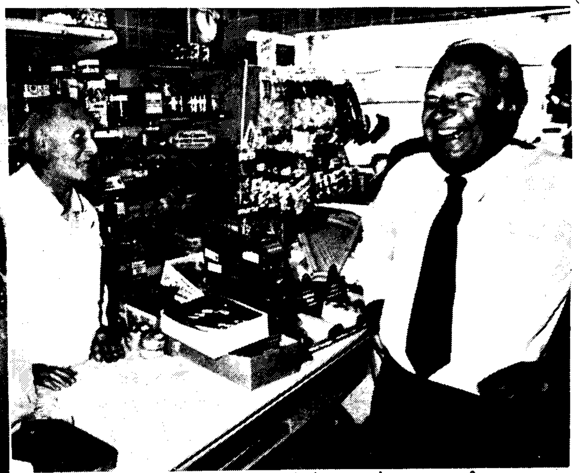
Housewives don't find rising prices so funny.