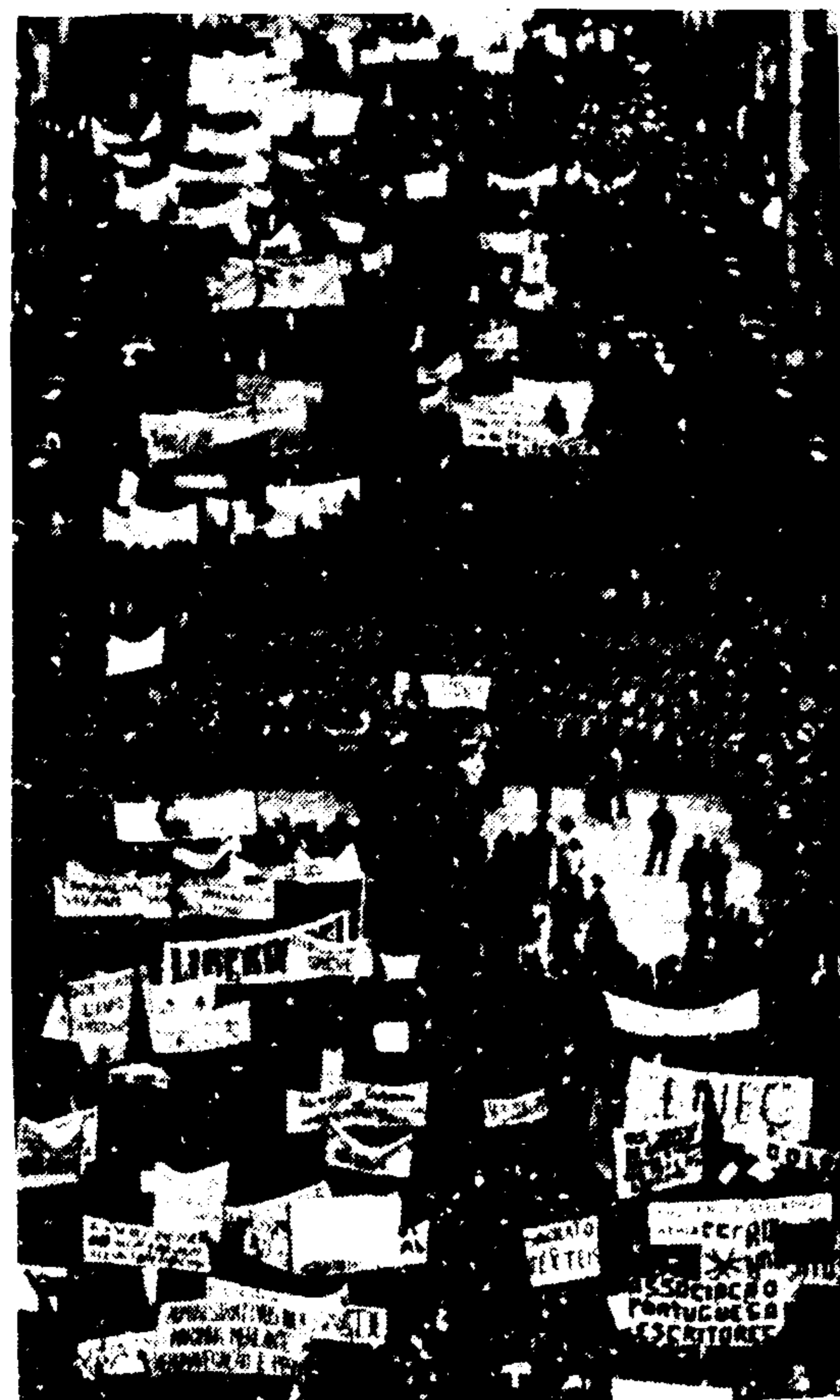
Workers celebrate the overthrow of fascism in Portugal

But drastic action is needed. Housing must be taken completely out of the sphere of private profit. Whilst guaranteeing full protection to owner-occupiers, Labour's last manifesto pledged the nationalization of all development land and municipalisation of private rented property. This must be done. The Tories and their capitalist system stand for homelessness, slum housing, ever-rising house prices and profits for the speculators. It's time all this was put an end